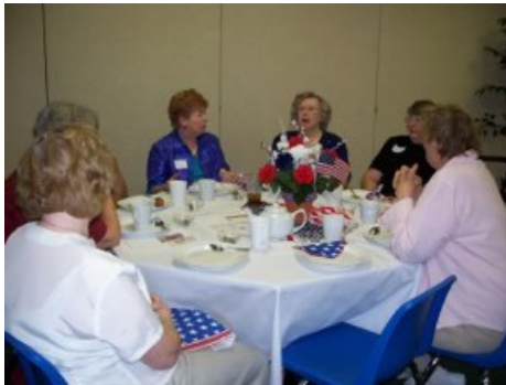
Lots to talk about!