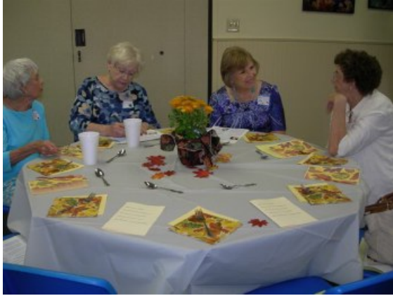
Lots of friends