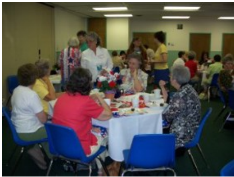
Lots of food!